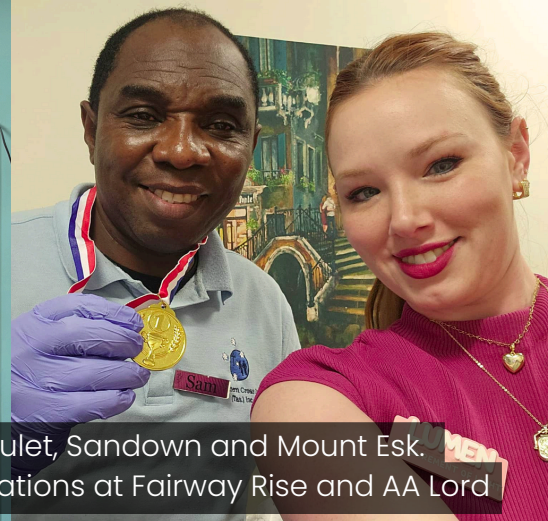
Above: SCC Week celebrations in full swing this November at Rivulet, Sandown and Mount Esk. Below, right: Fashion stakes were high during Melbourne Cup celebrations at Fairway Rise and AA Lord